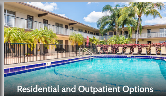
Residential and Outpatient Options