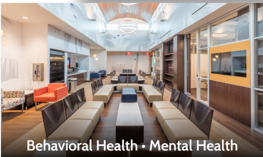
Behavioral Health • Mental Health